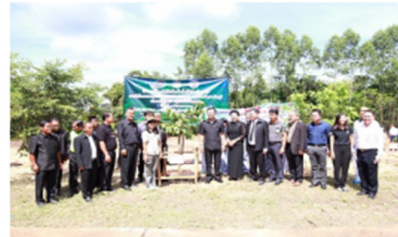
Participate in activities of recycle waste with community