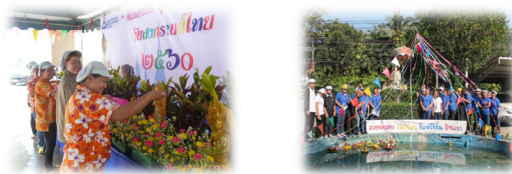
Festive activities for Song Kran and Loy Kratong

Awareness and preparedness training to employees.