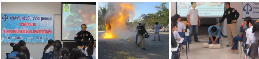
First aids and serious injury avoidance

Company pay attention to provide training of emergency preparedness and response to Contract service vendor for life safety and serious injury avoidance.