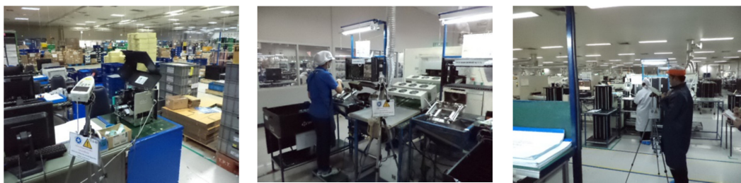
Environmental impact inspection in manufacturing area

The Company shall strictly comply with the environmental laws and provisions of the government sector constantly and continuously by monitoring the working environment either air, dust or noise whether they meet all the standard criteria which will not affect or destroy the environment and resources of the community,