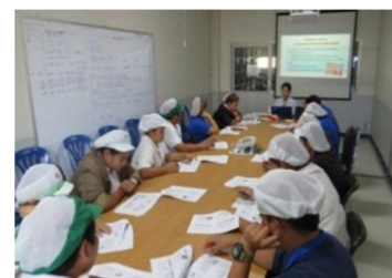
Doctor visit and consult services