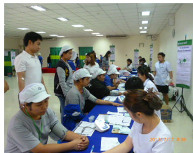
Physical examination for the employees