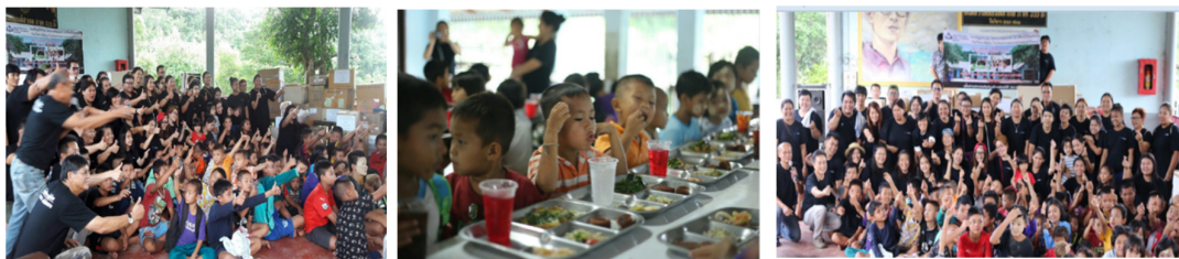
The voluntary camp to donate for necessities to the school in Ratchaburi province.