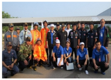
Basic firefighting training and emergency respond team