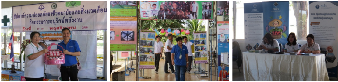
Safety Week Awareness & Work Safety Exhibition

Employee Participation Company was organized to promote the involvement of employees such as social care, volunteer contribution to society, activities on national tradition event.