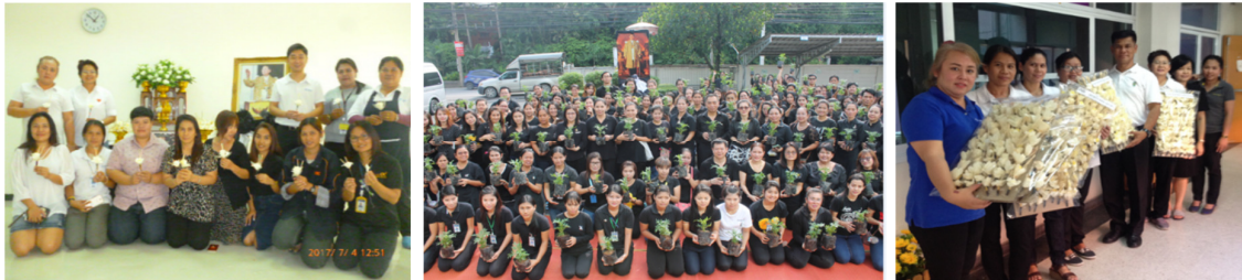
make sandalwood flower (Daffodill) in remembrance of the Late H.M. King Bhumibol Adulyadej.

Employee Participation Company was organized to promote the involvement of employees such as social care, volunteer contribution to society, activities on national tradition event.