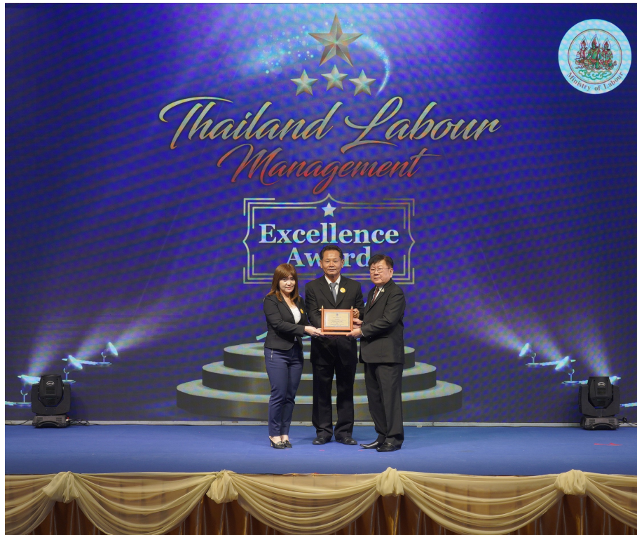
Thailand Labour Excellence Award 2019