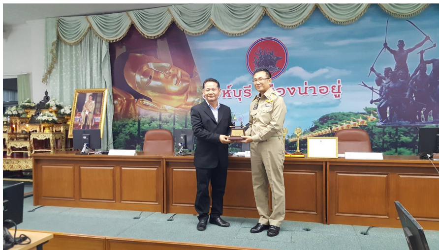
Provident Fund Excellence Award 2019

The company treats workers fairly by LPA (No. 2) BE 2551 Labour Relations Act.