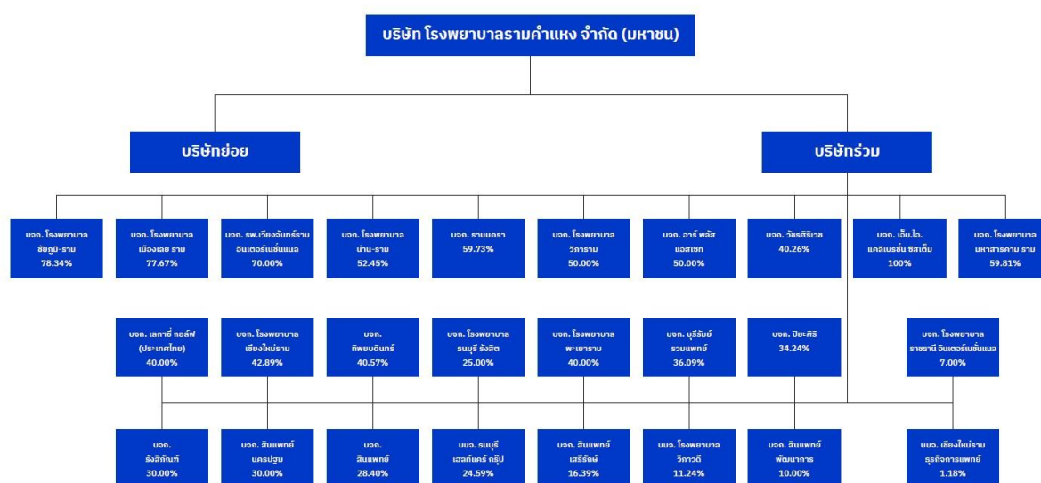
Group Company Shareholding Structure