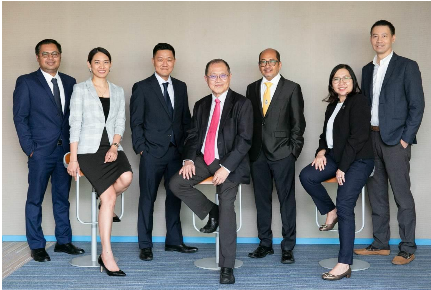
The Board of Directors

Attachment 1 Details of Directors, Executives, and Controlling Person, A person assigned the highest responsibility in accounting and finance, A persons assigned to be directly responsible for overseeing accounting, the Company Secretary and coordinating agent in case of foreign company