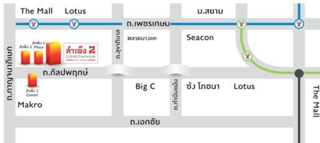
MAP โครงการสำเพ็ง2 กอบโกมที่ดิน