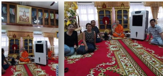
The activity of offering cool fans at Suthat Temple, Thepwararam Ratchaworawihan