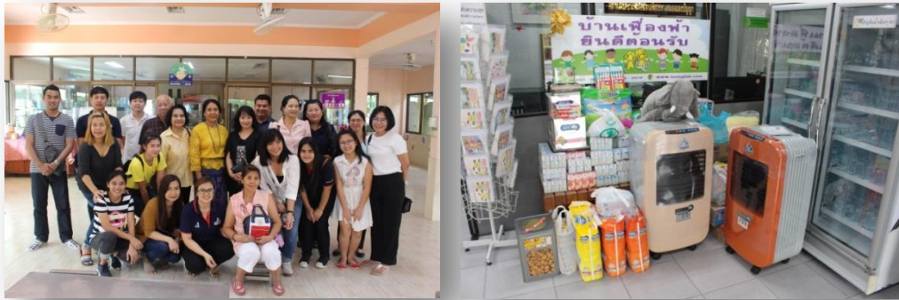
Food and activities Consumption-consumption

At the Child and Mental and Intellectual Property Office, Bang Talat Sub-district, Pak Kret District Nonthaburi