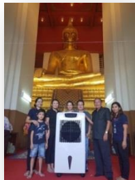
The activity of offering a cool fan at Wihan Phra Mongkhon Bophit Located at Pratu Chai Sub-district Phra Nakhon Si Ayutthaya District Phra Nakhon Si Ayutthaya Province

In the year 2018, the executives and employees of the company brought a fan and give to benefit the religious Location for public service and various homes.