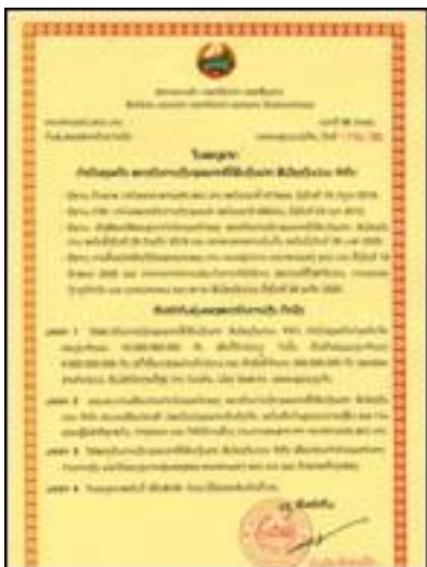
License to operate a business Loan rental service