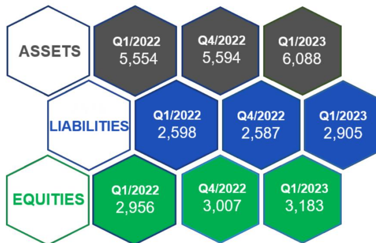
Figure 3: Comparison of Statements of Financial Position (Quarterly)

The reasons for the change from the consolidated statement of financial position are as follows.