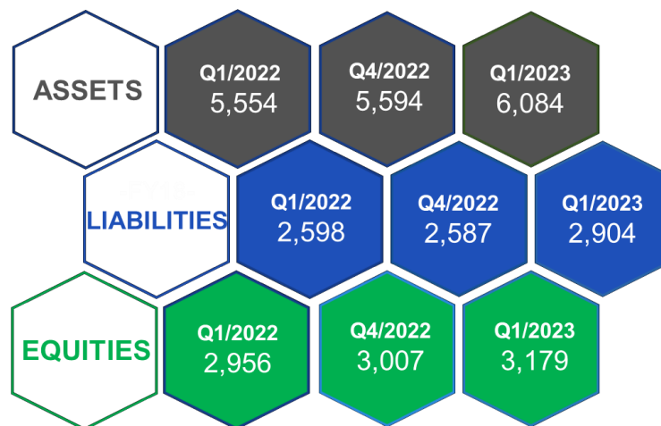
Figure 3: Comparison of Statements of Financial Position (Quarterly)

The reasons for the change from the consolidated statement of financial position are as follows.