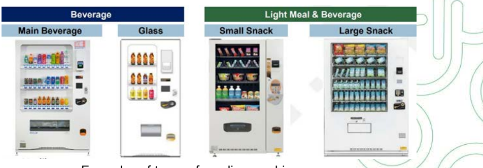
Examples of types of vending machines

(1) No more than 2,522 functional vending machines divided into 1,113 beverage vending machines ("Beverage Type") and 971 food vending machines ("Light Meal & Snack Type") which are located in various places around 2,084 machines and the rest are located in the warehouse in ready-to-use condition.