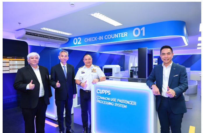
The Company's executives joined the launch event of "SKY Aviation Lab" at Kasetsart University

3) Regarding the progress of subsidiaries within the Group, Pro Inside Public Company Limited ("PIS"), a subsidiary in which the Company holds 67.70% of total shares, announced its 2025 operating results with total revenue of Baht 3,132 million, an increase of 113%, and net profit of Baht 271 million, an increase of 163% compared to the previous year. PIS also has a backlog of Baht 3,494 million in projects pending revenue recognition. PIS has set a revenue growth target of 10–15% in 2026, driven by continuous participation in bidding for large-scale projects. The success of PIS reflects the strength of the Group Synergy business structure and confirms that the Spin-Off strategy executed in 2025 has delivered tangible returns.